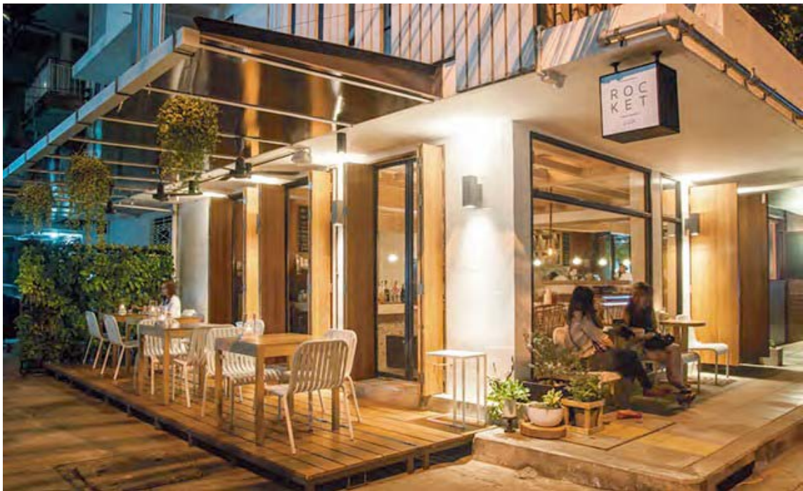
Guests can enjoy an outdoor seating area.