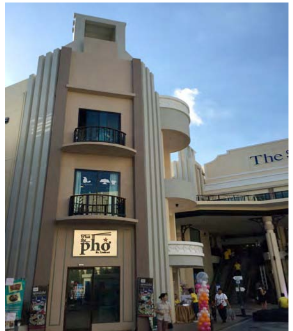
The architectural design of the building is contemporary art deco style.