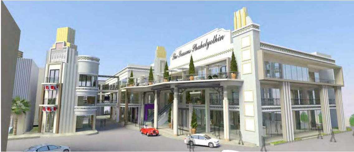
Artist's impressions (above & below) of the new lifestyle mall. The Seasons provides a retail space of over 6,000 square meters with over 200 stores.