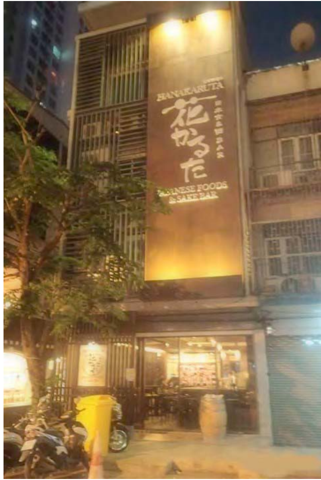
Entrance to Hanakaruta.