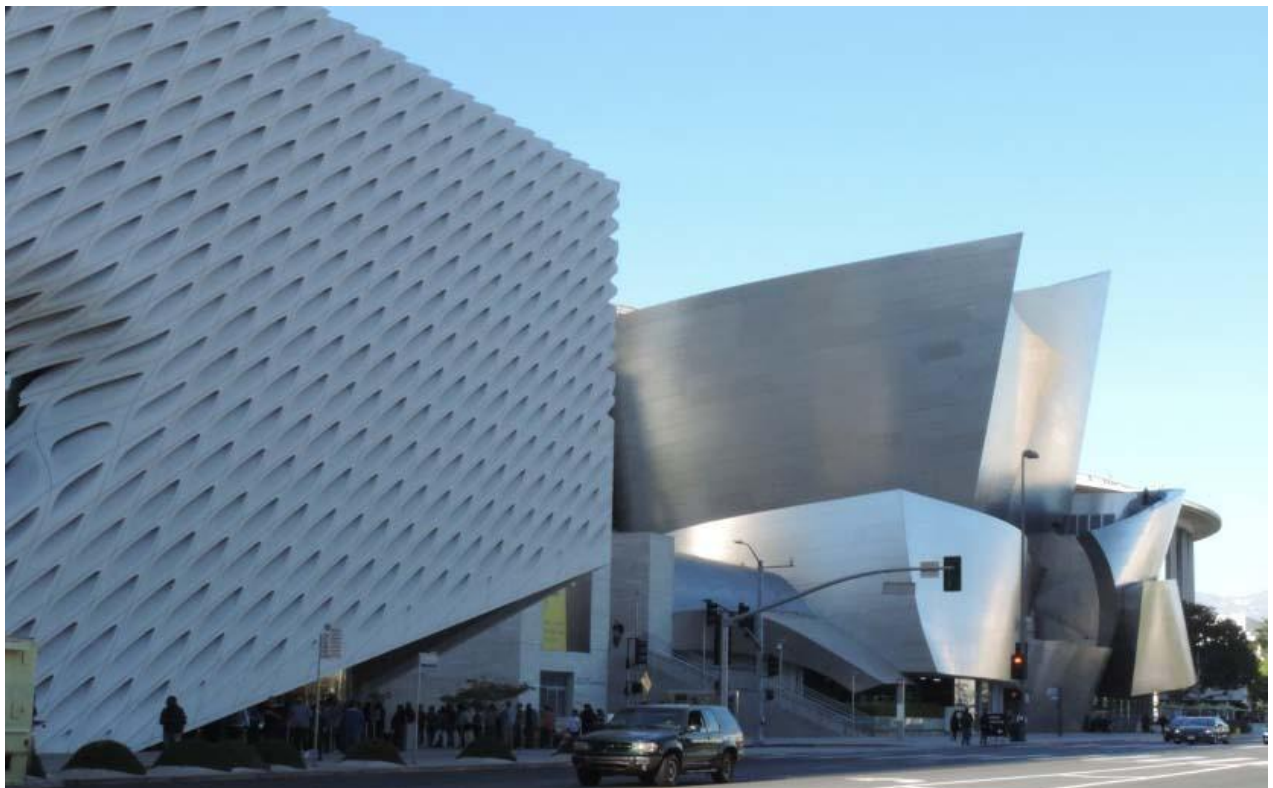
View of the exterior and facade