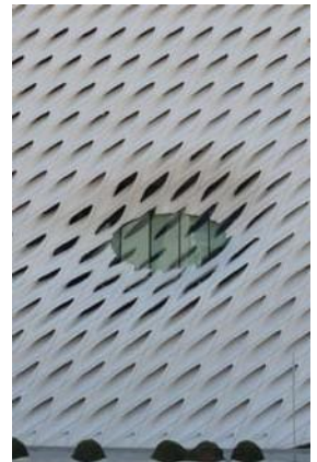
Detail of the concrete wall and fiber reinforced concrete facade.