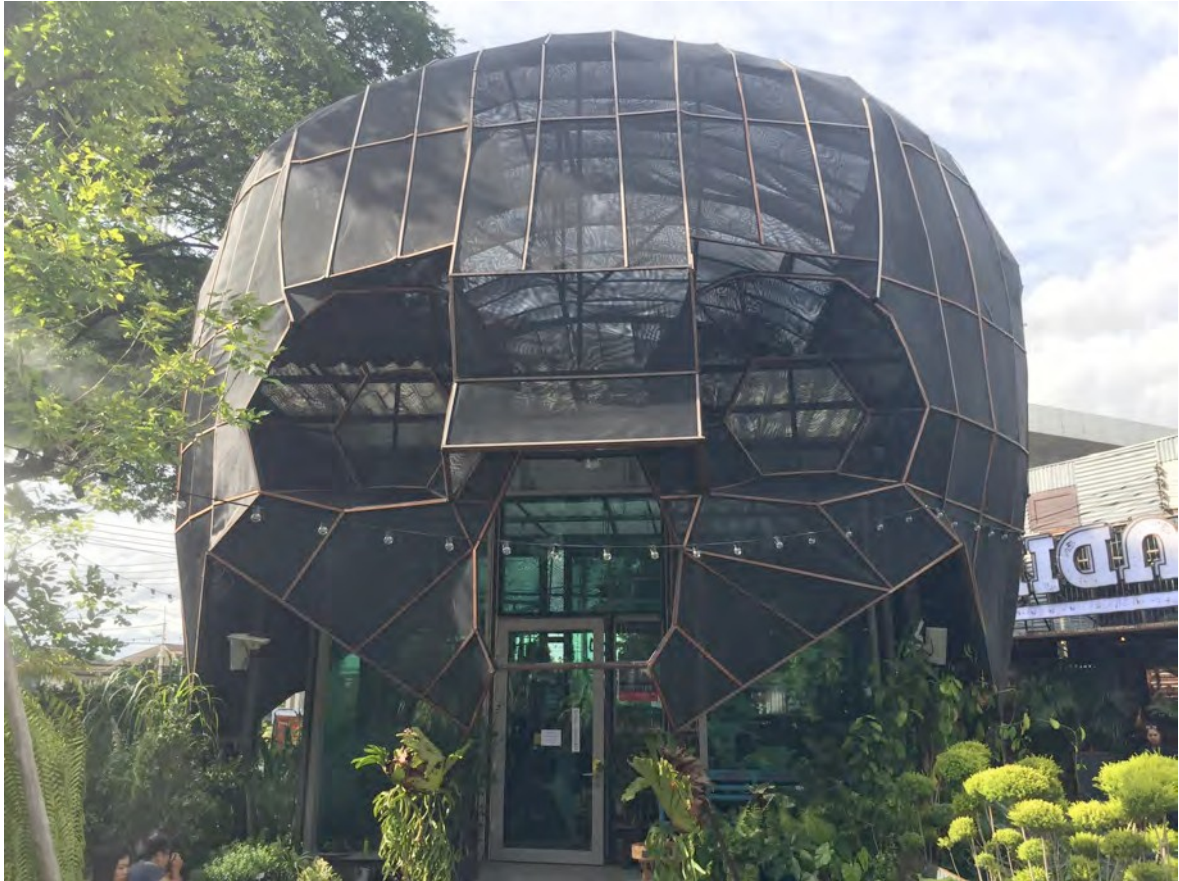
This funky façade hides a plant store.