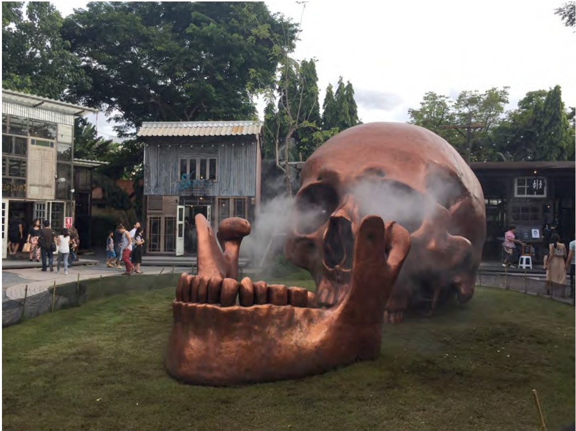
There are works of art throughout the space like this large sculpture of a skull.