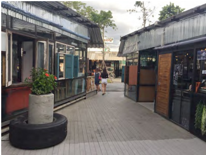
Roofs are made from sheet metal.