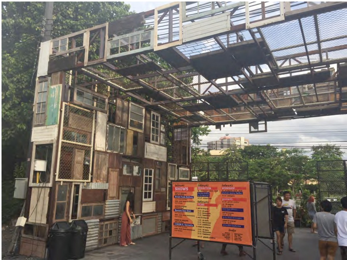
Entrance to ChangChui, all constructed from recycled doors and windows.