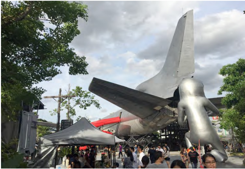
One of the main attractions is a decommissioned Lockheed TriStar airplane which will serve as a restaurant in the future. Below the wings of the airplane there's an outdoor café.