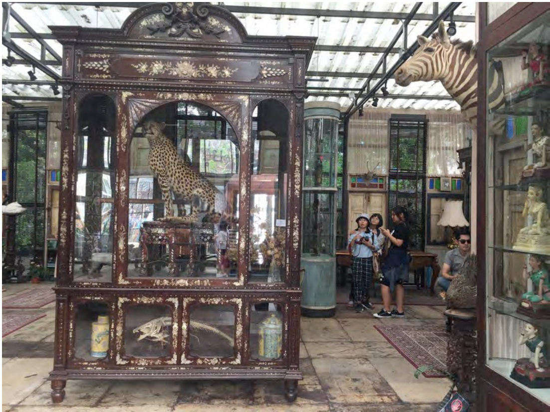
Interesting stores include a “cabinet of curiosities” type shop (above & below).