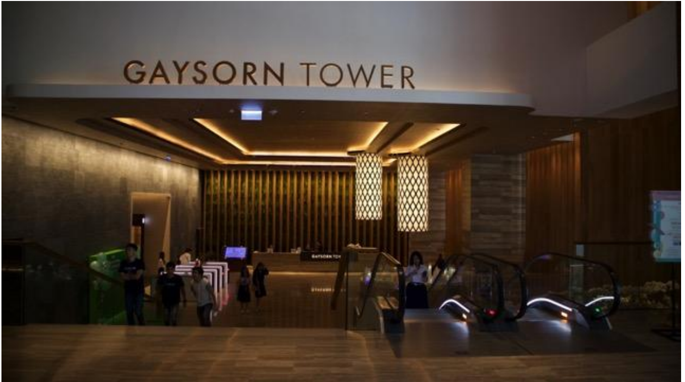
Entrance to the office tower, situated at Gaysorn Plaza shopping center.