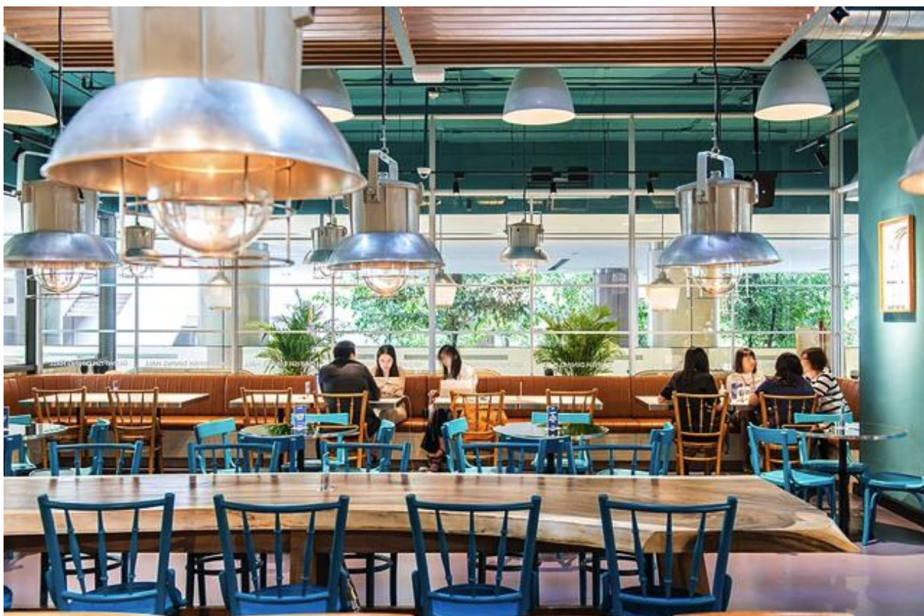
The self-serving co-dining space offers a choice of seating arrangements, ranging from a long wooden table for a large group, a high table and stool for solo diners and two 4-seaters for socializing.