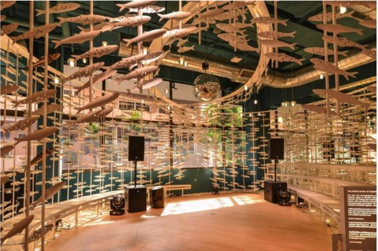
Throughout the space, co-workers will find art and tech installations to inspire them.