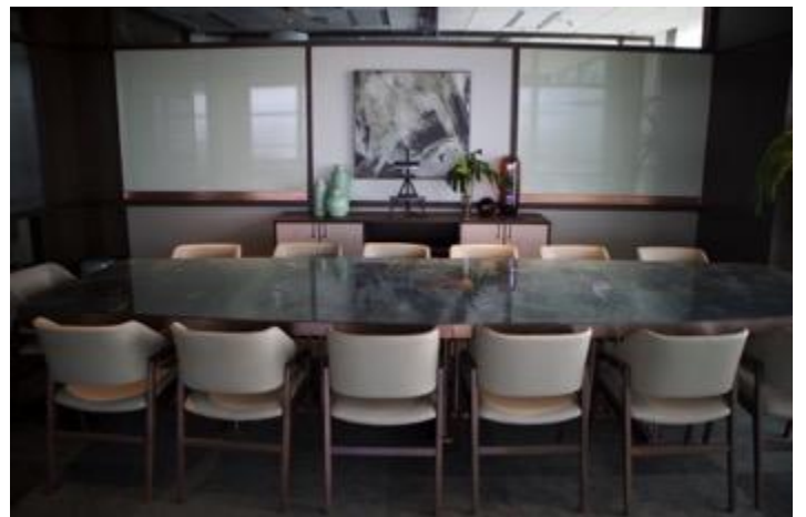
Private meetings rooms