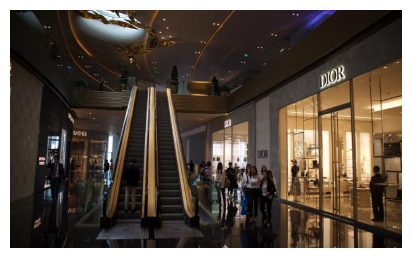
Many brands have their flagship stores at IconSiam, including Thailand's first Apple store.