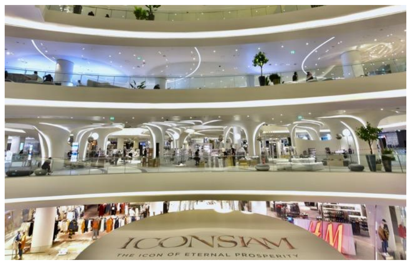
Impressions of the interior of IconSiam.