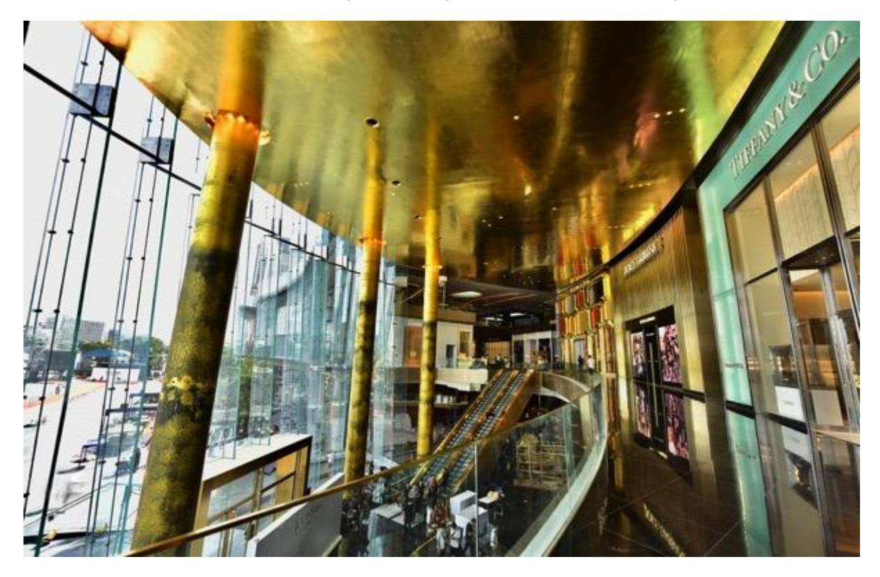
The building is next to the river and is built with specially commissioned pillarless glass, said to be the longest in the world.