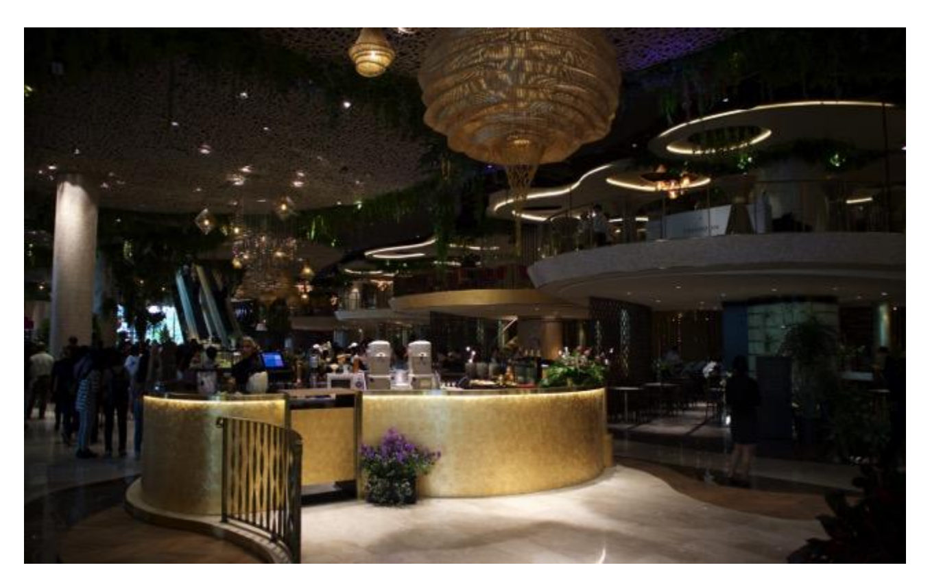
Restaurant area on the ground floor.