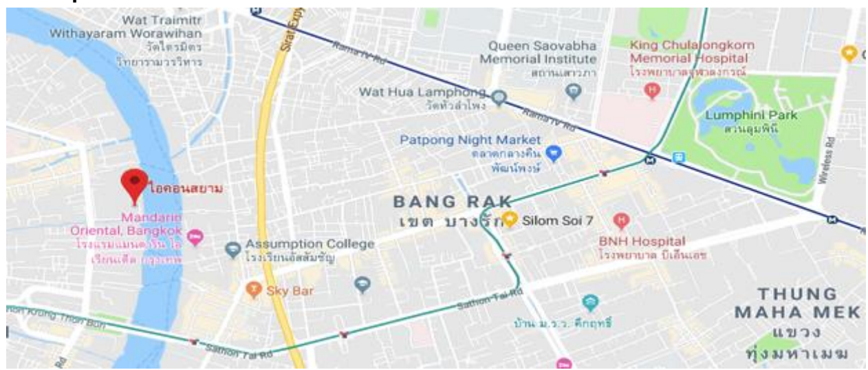
Bangkok's newest riverside landmark development IconSiam is located along the banks of the Chao Praya River, on the other side of central Bangkok.