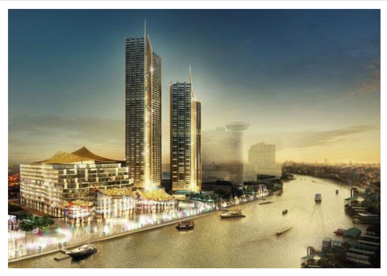
The architectural design of IconSiam is inspired by how a krathong is folded, while IconLuxe resembles 3 glass krathongs that stretch 300 meters along the river.