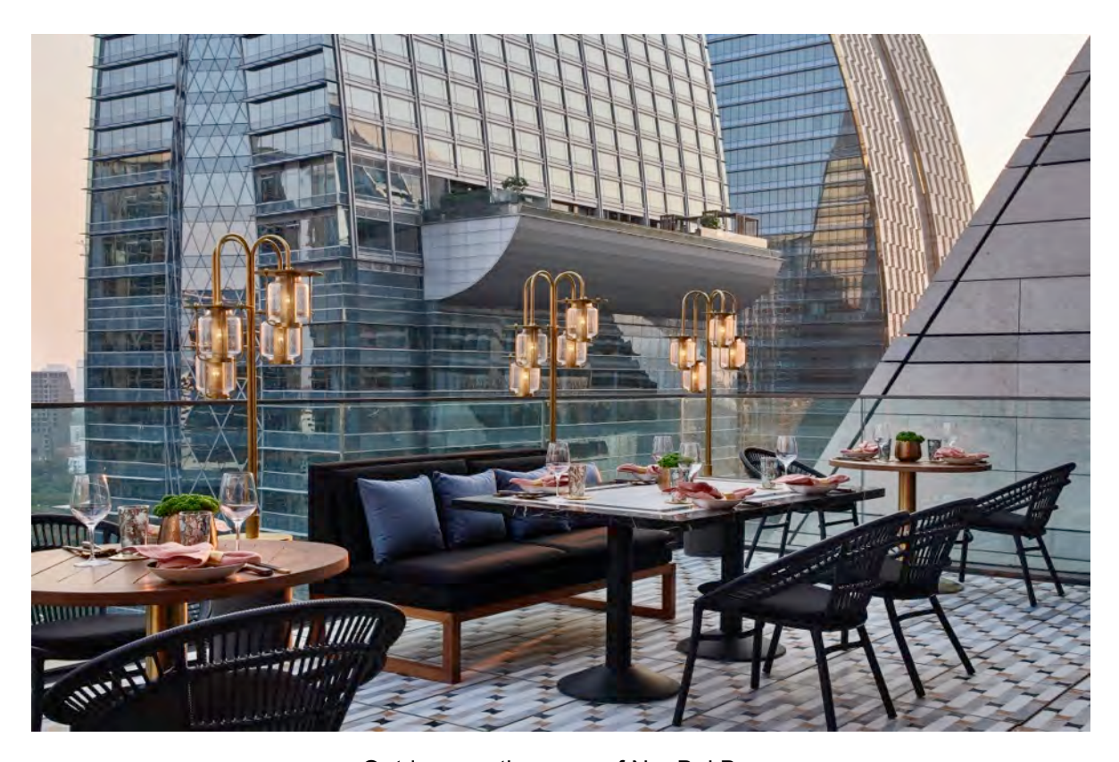
Outdoor seating area of NanBei Bar