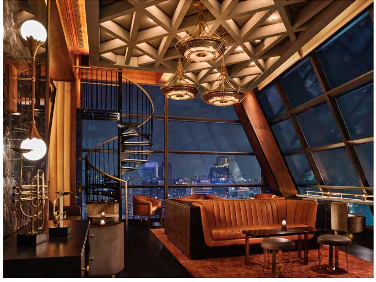
Lennon's East Lounge bar