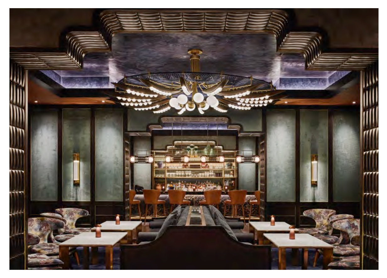
Nan Bei Bar, Rosewood Bangkok's landmark restaurant, offers regional specialties from China.