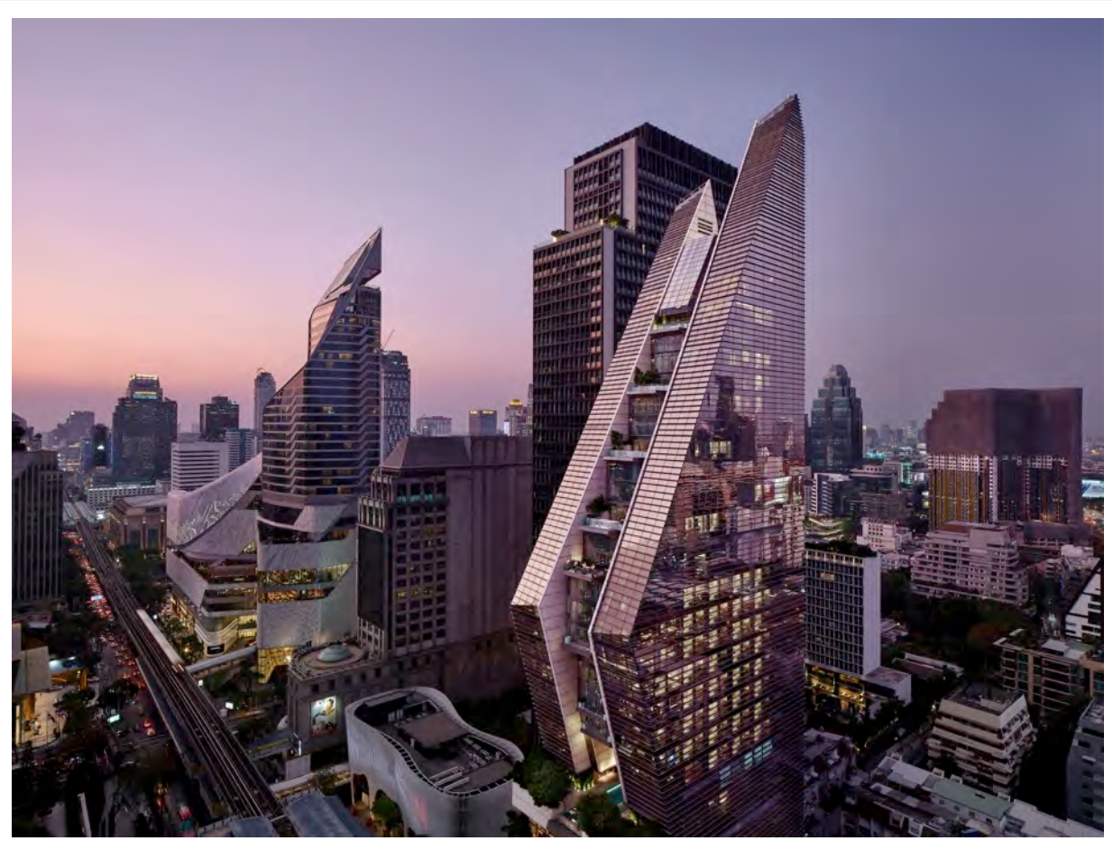
The 30-storey tower features a sloping façade.