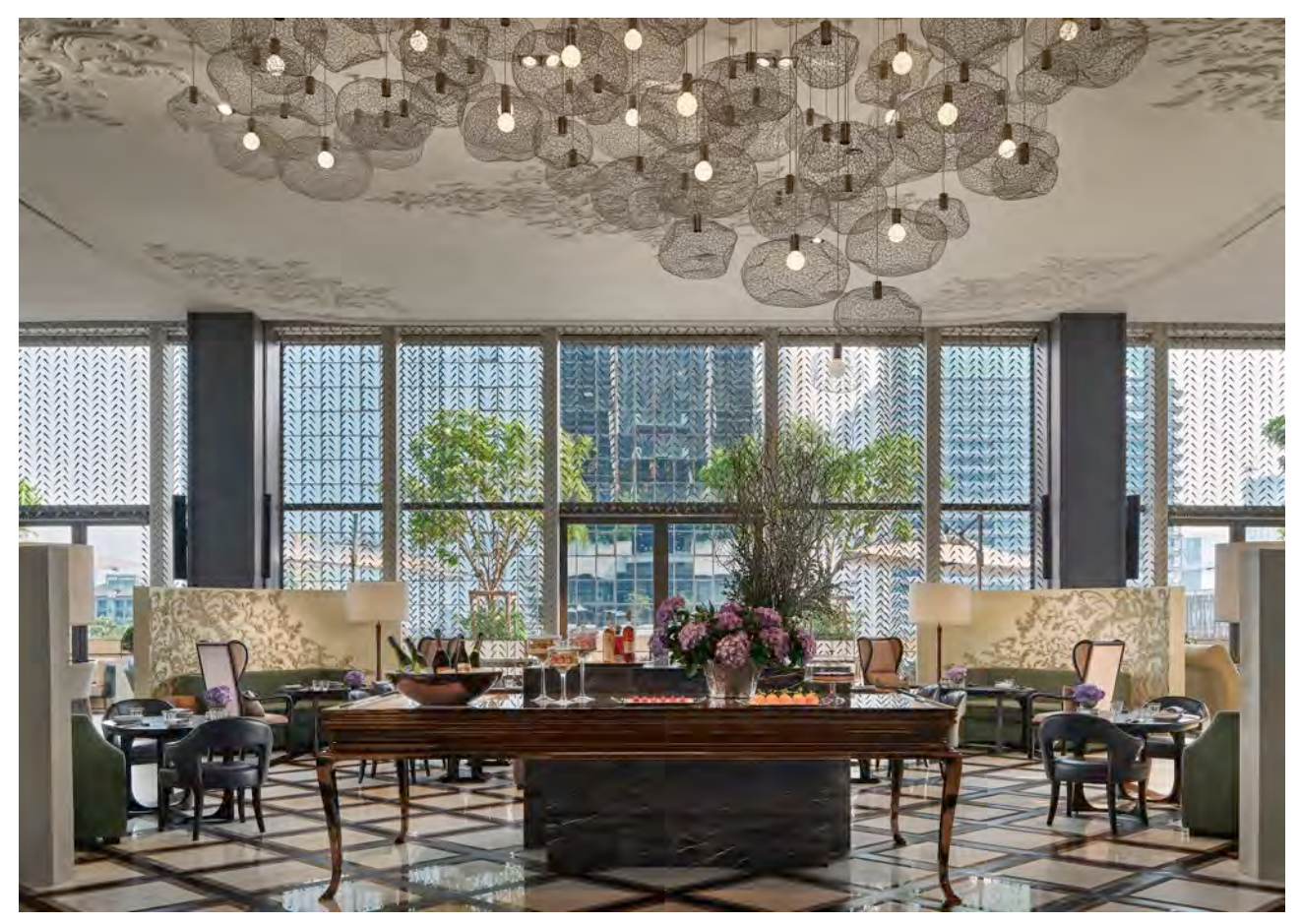
Lakorn Brasserie Lakorn, an all-day dining venue serving European cuisine