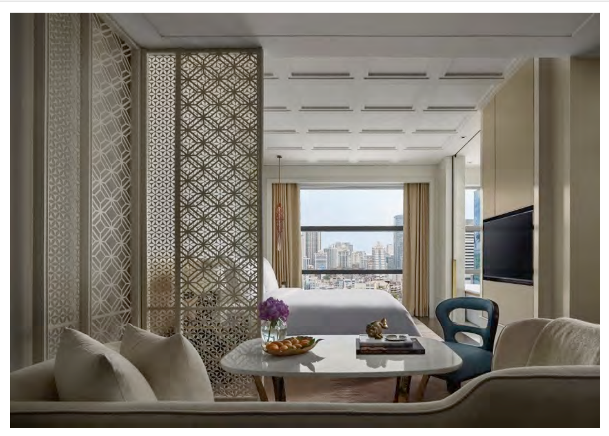
Guestrooms have been decorated in a contemporary Thai style