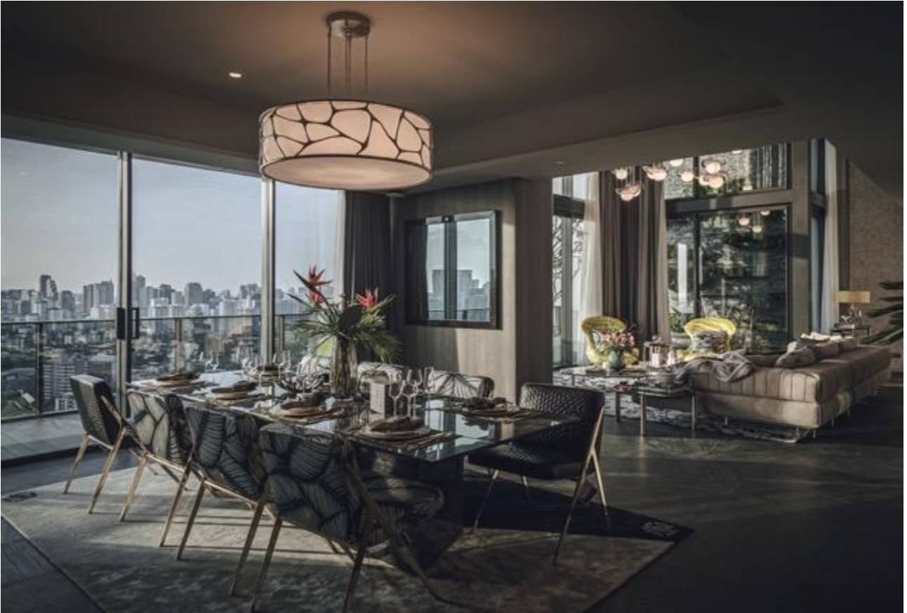
Roberto Cavalli is known for his love of animal prints. The new collection embodies a tropical lush jungle combined with glam-chic.