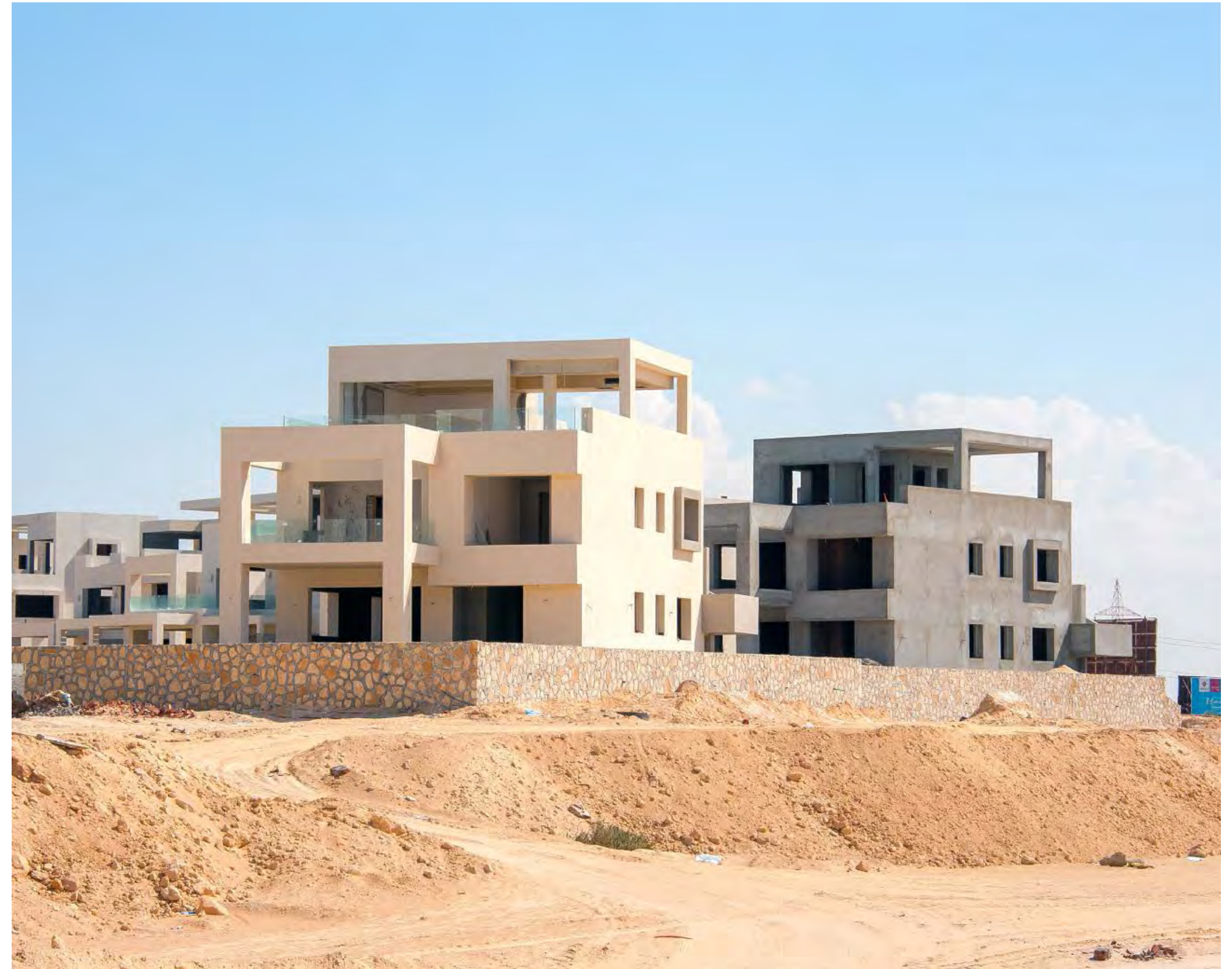
Apartments and landscaping, Marassi