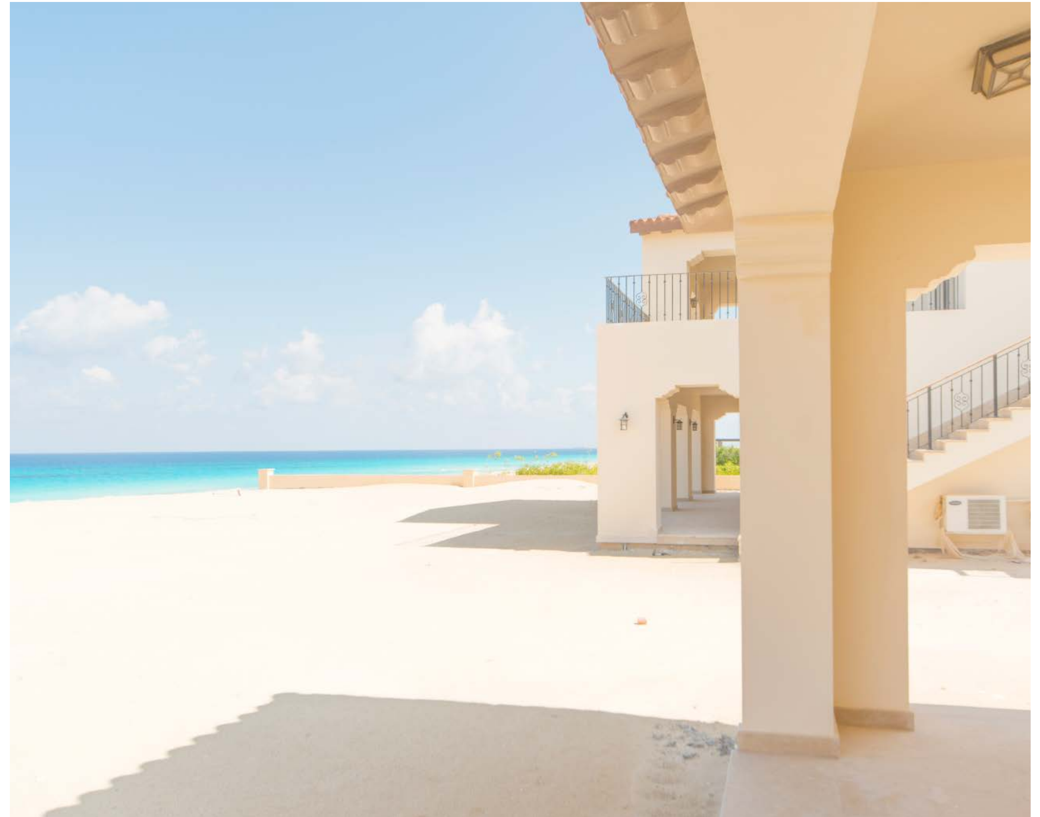
Beach front villas, Marassi