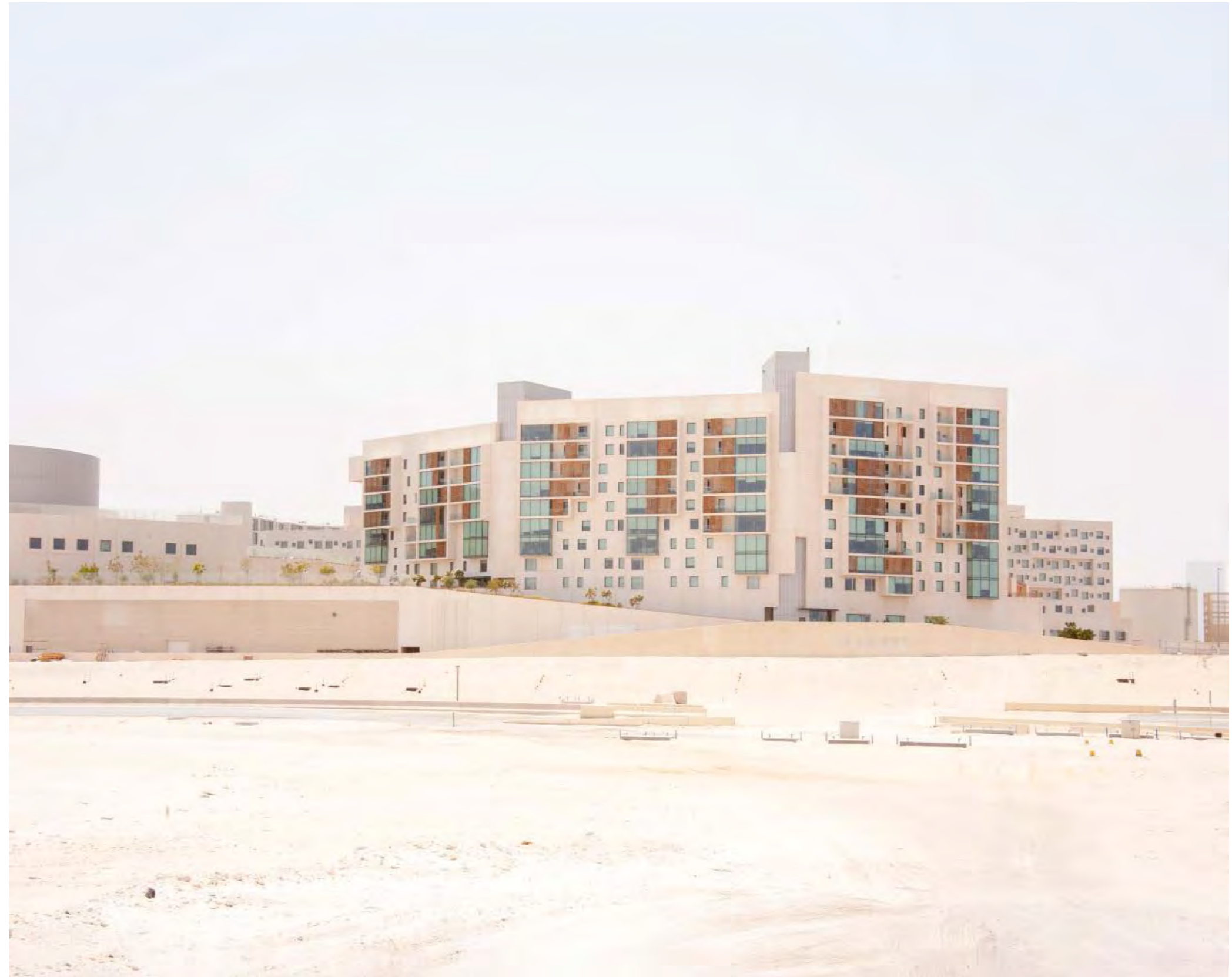
New York University, Abu Dhabi