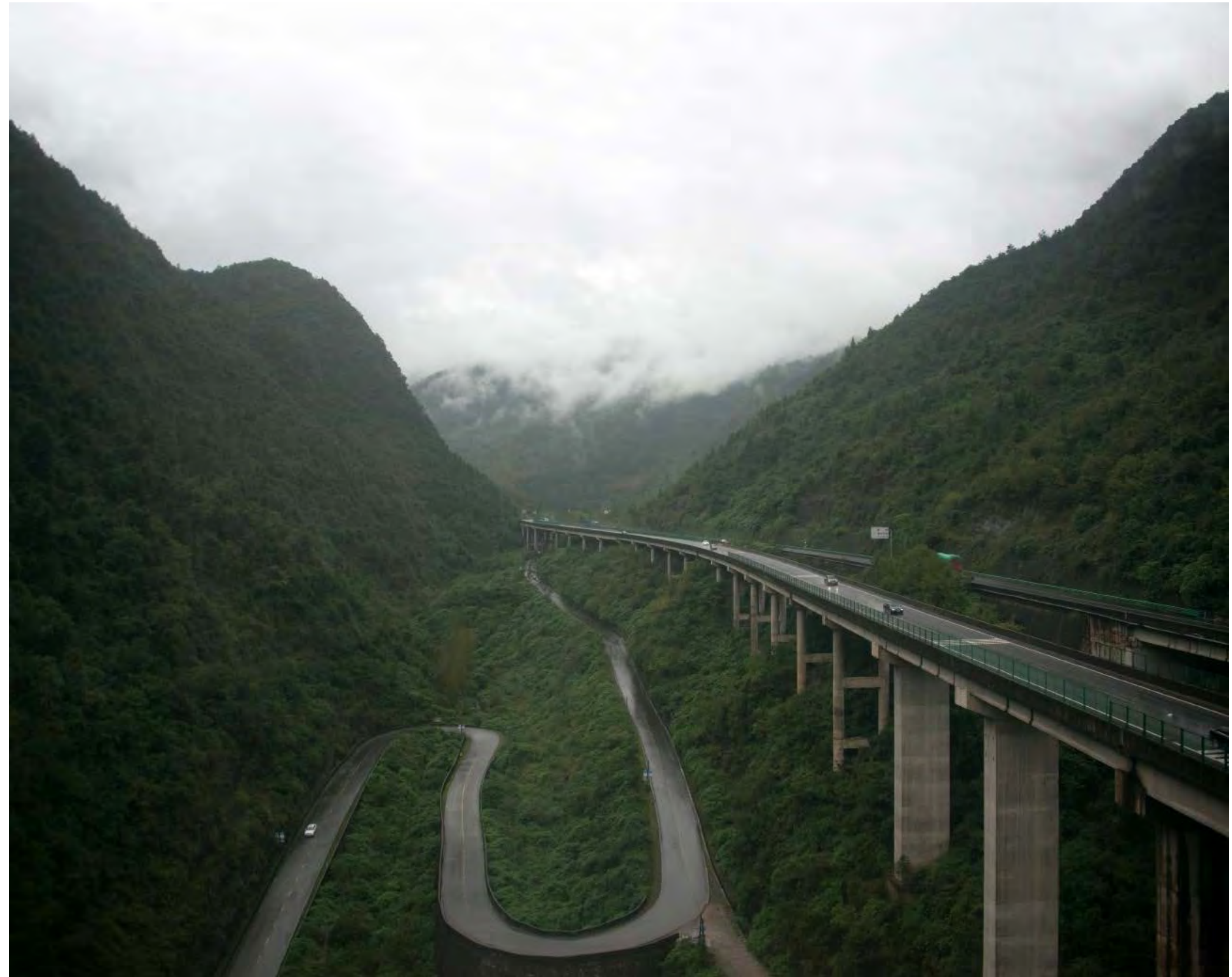
Infrastructure, Daba Mountains, Hubei Province