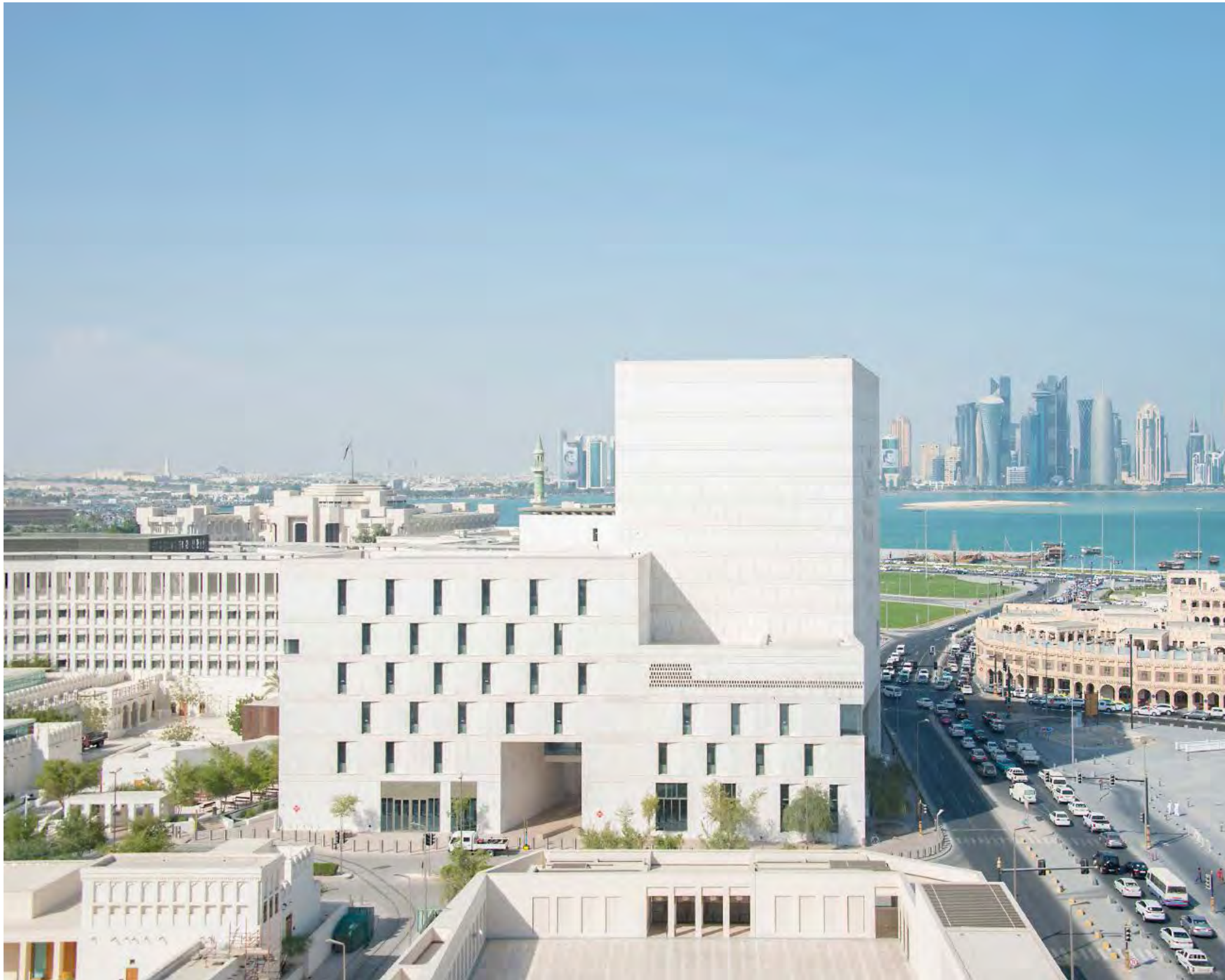
Msheireb Museums and Archives building, MDD