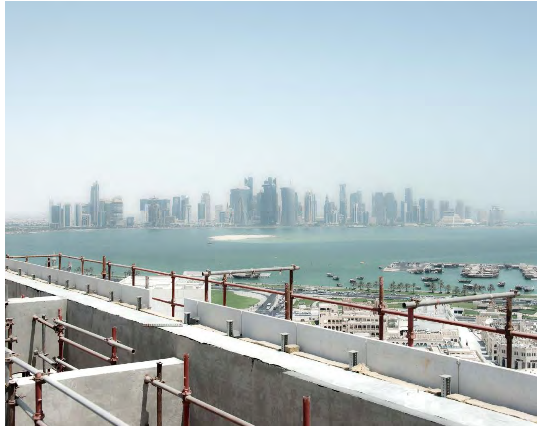
West Bay skyline on reclaimed land