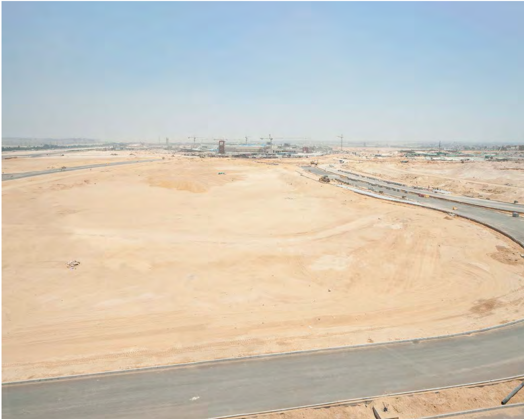
Landscaping and infrastructure, Cairo Festival City