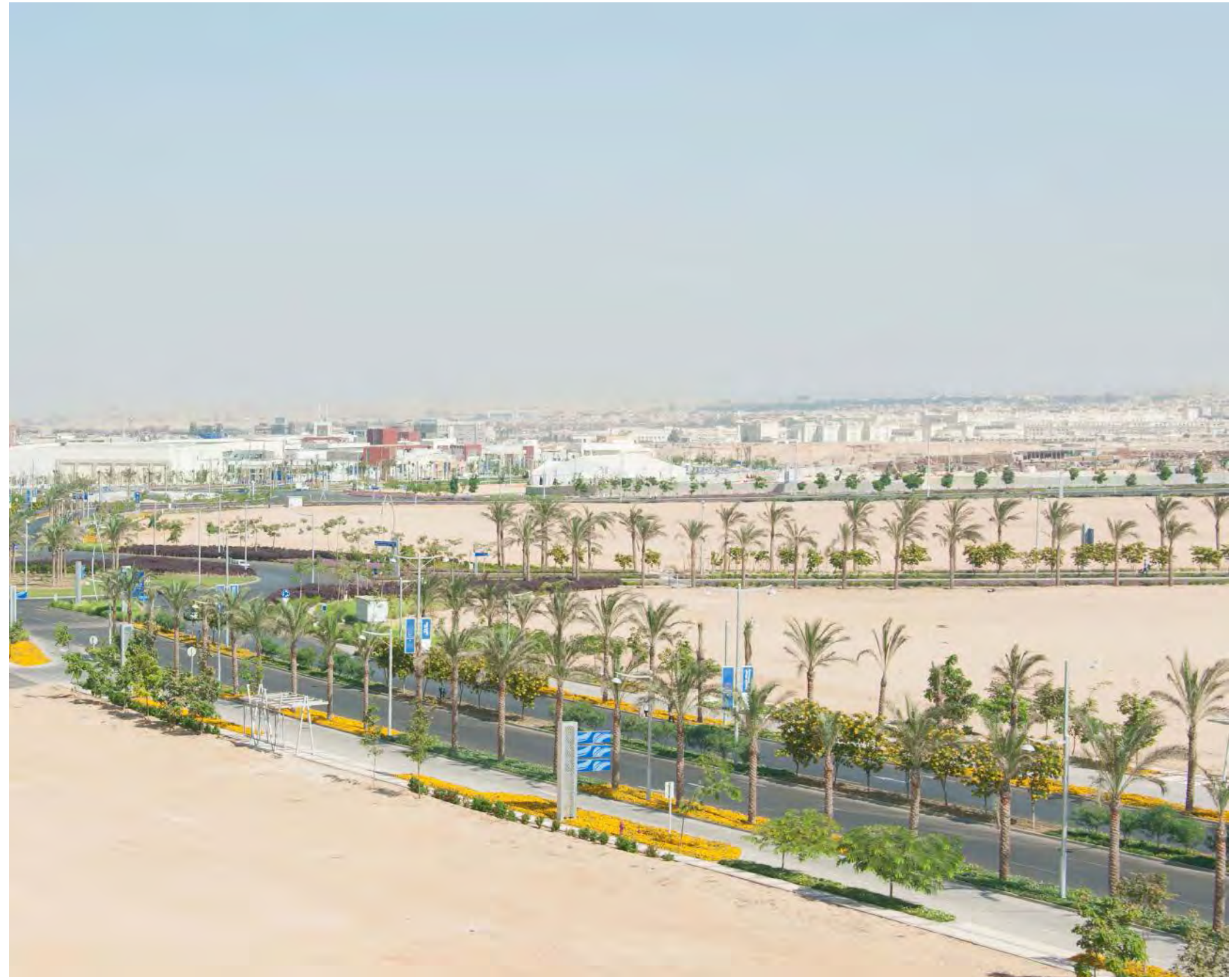
Landscaping and infrastructure, Cairo Festival City, New Cairo