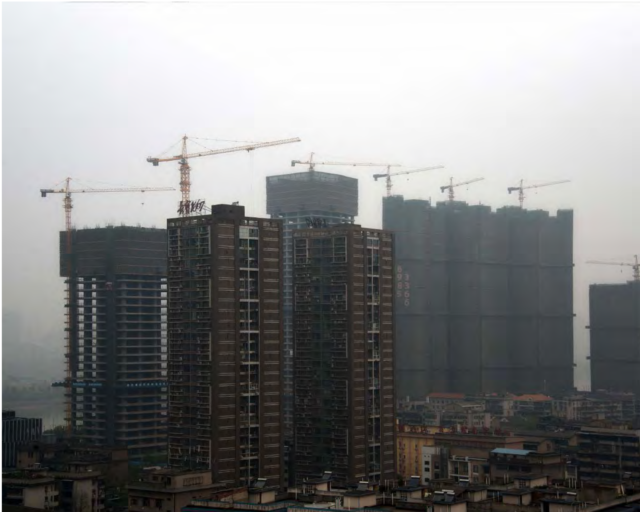
Residential towers rising among hutong networks and old apartment blocks, Changsha