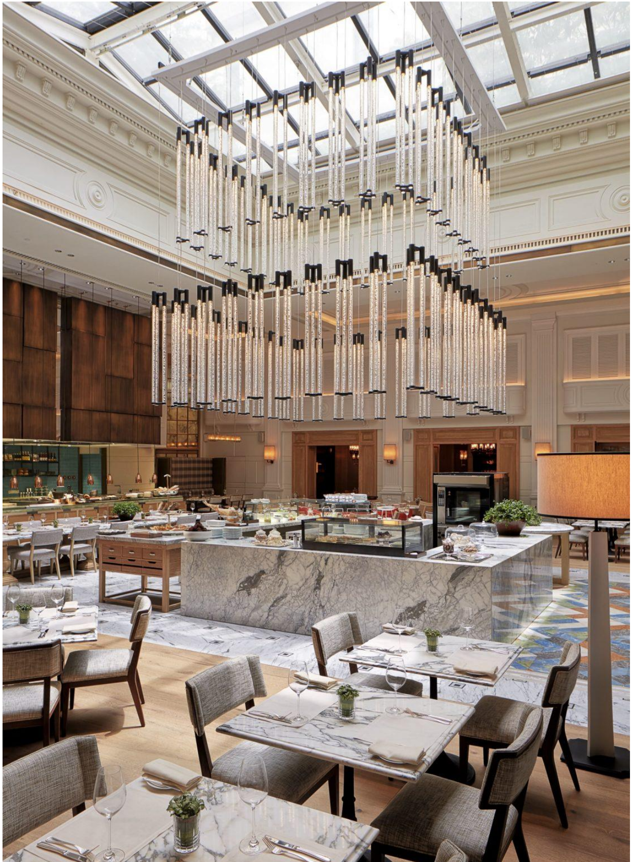
NOVA European brasserie.