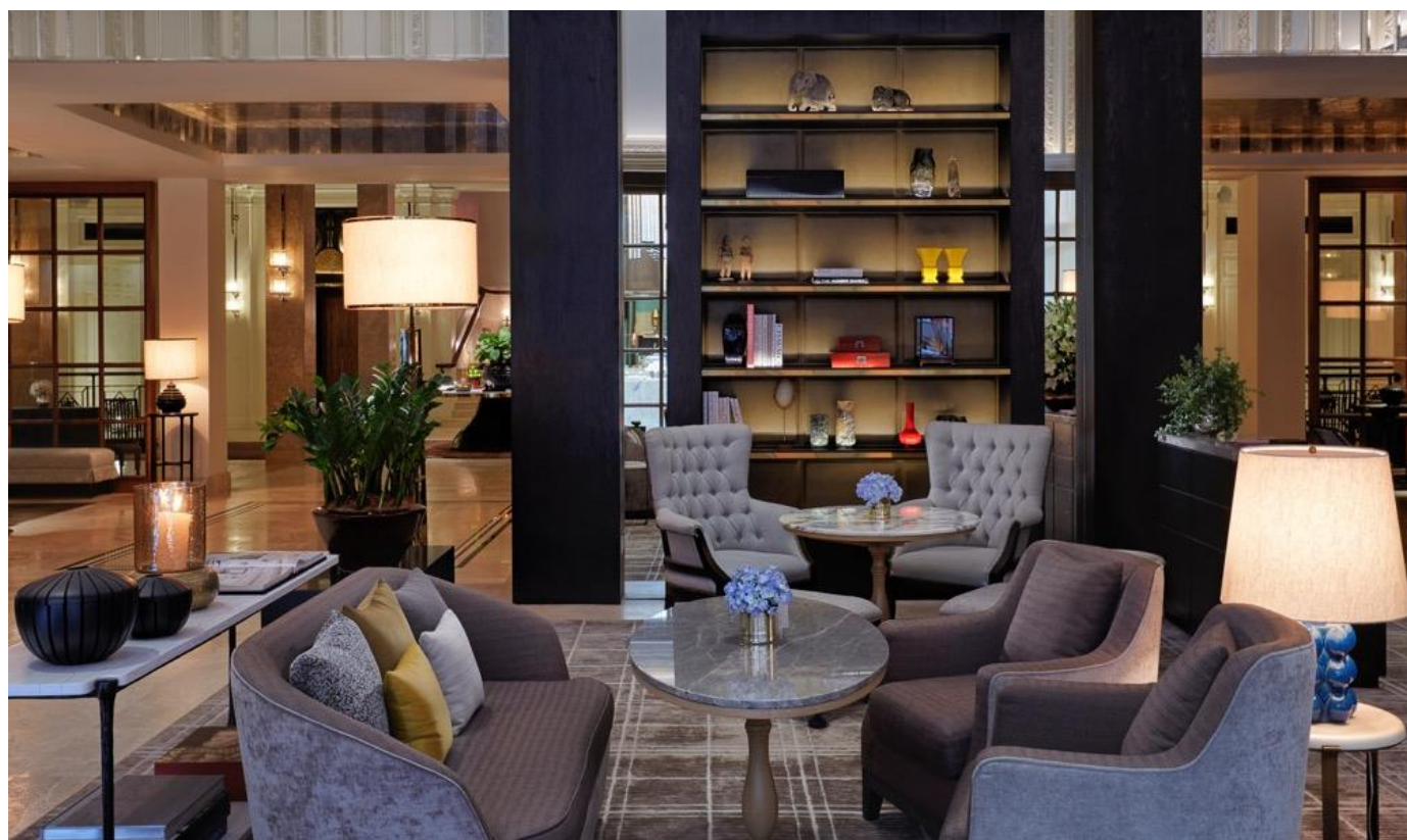
Living room area of NOVA brasserie.