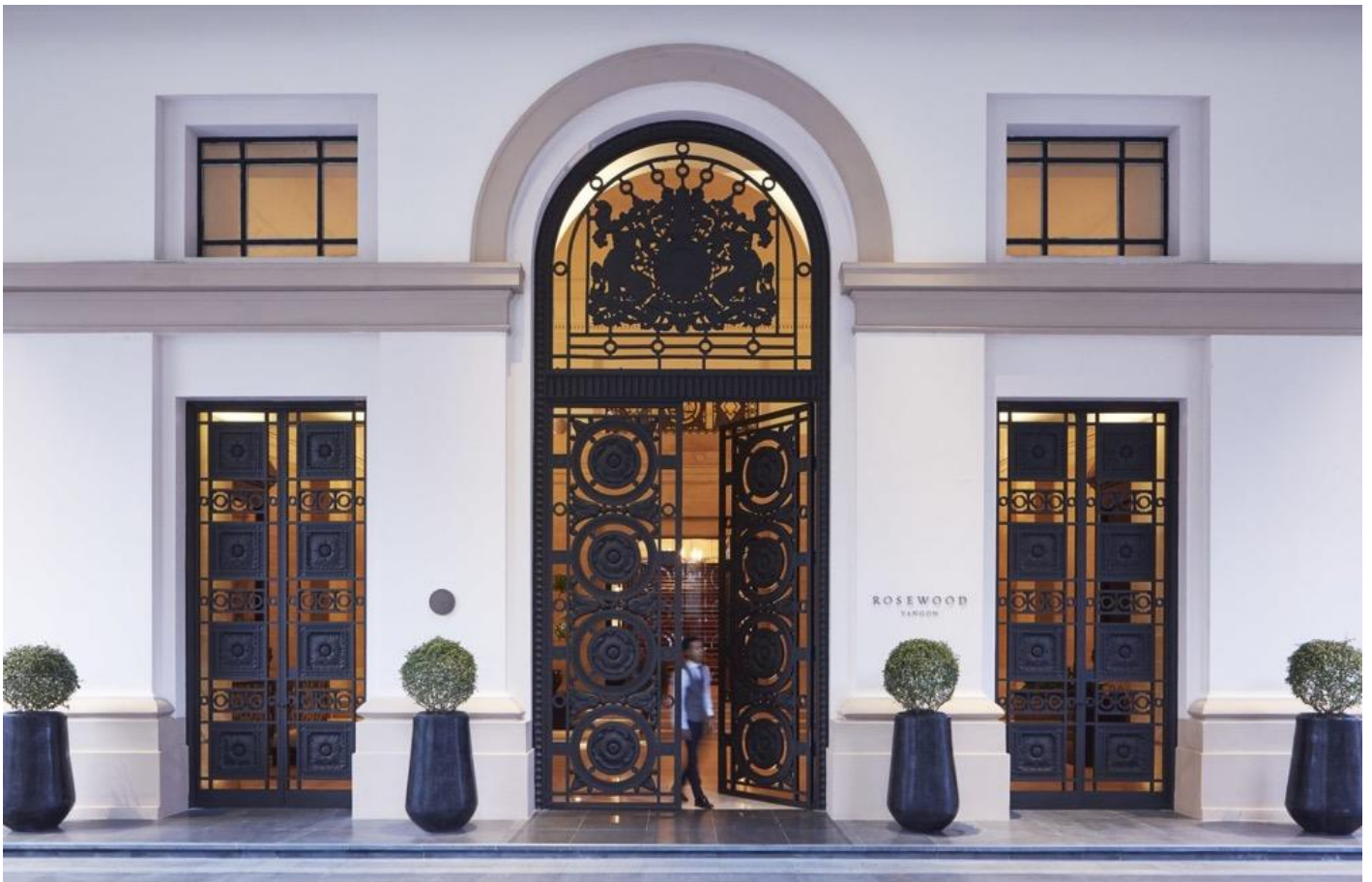
Grand iron-framed doors exude a feeling of grandeur upon entering the hotel.