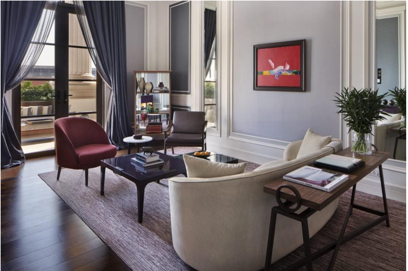
The hotel's 205 stylishly designed rooms and suites are carefully crafted to highlight the architectural beauty of the building.