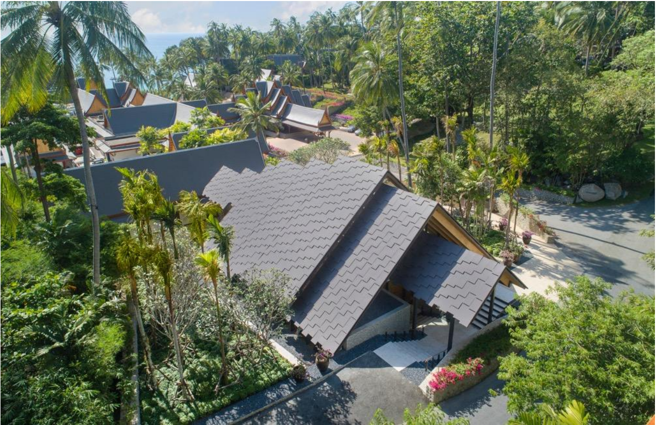
The steeply pitched roof of the new pavilion is in keeping with Amanpuri's inspiration – the ancient Thai capital of Ayutthaya.