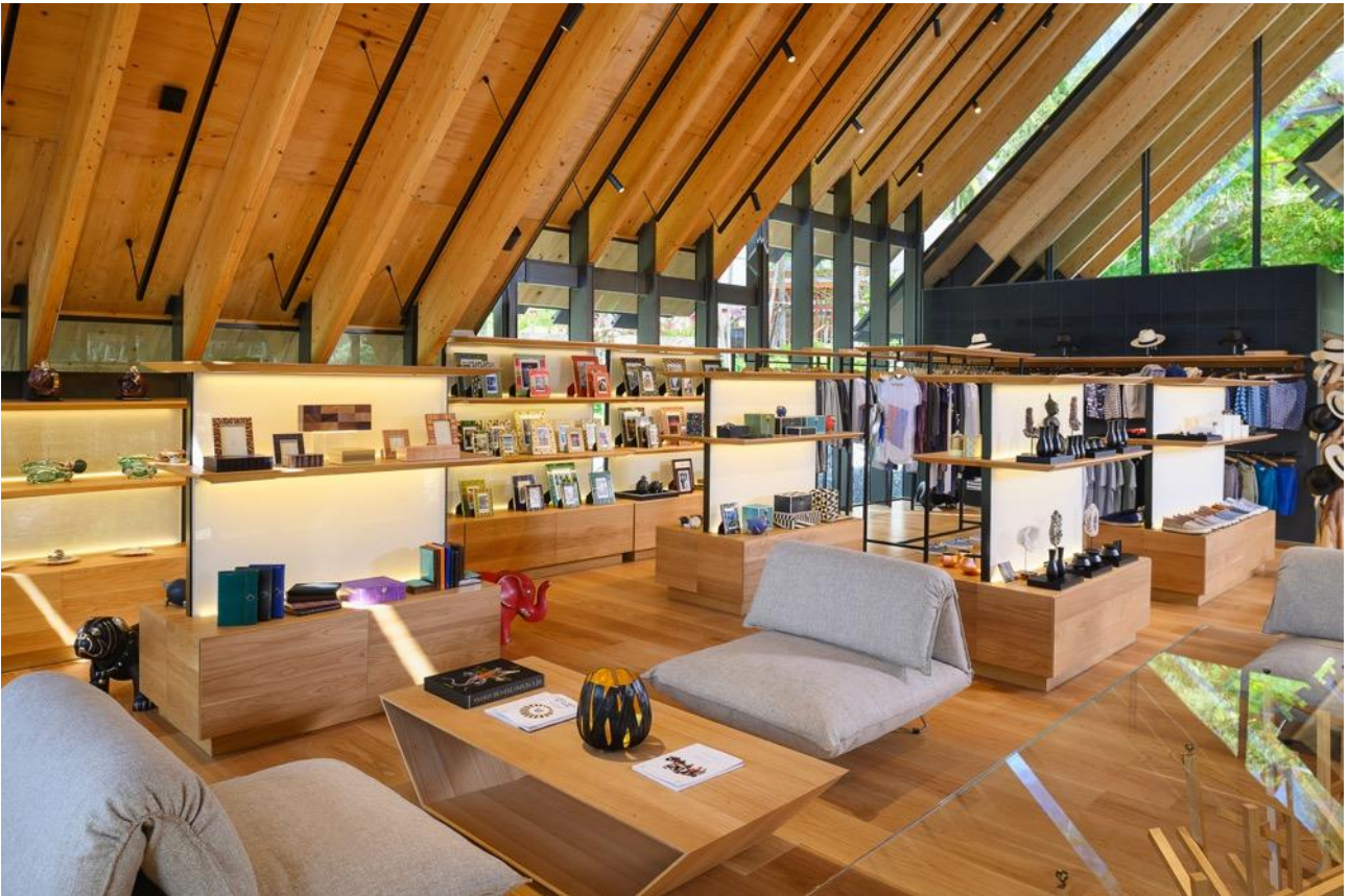
Guests can relax on limited edition furniture pieces, also designed by Kengo Kuma.