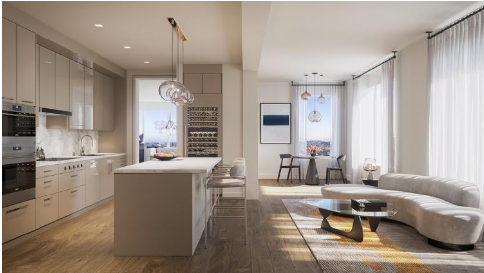
Custom-designed hand-tufted wool rugs and natural wood floors give the interior a stylish look.