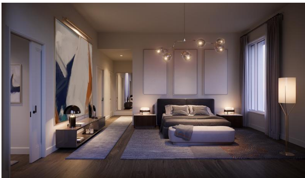
It Features include wood floors and a warm palette of textures with splashes of color.