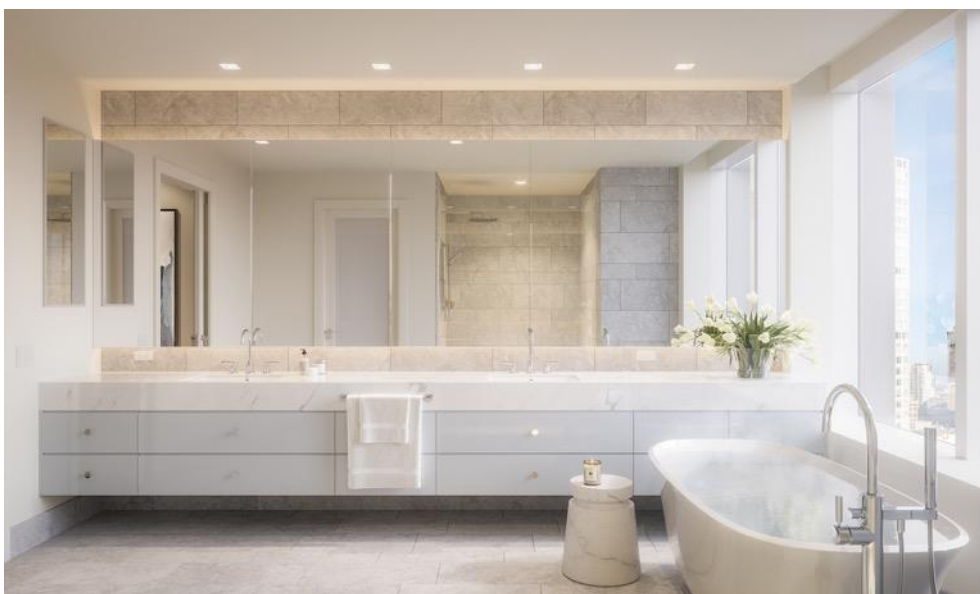
For the bathroom, both classical and contemporary materials are used in a tranquil, cool-toned color palette.