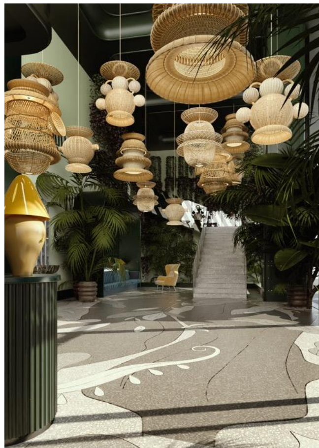
Entrance to the hotel.