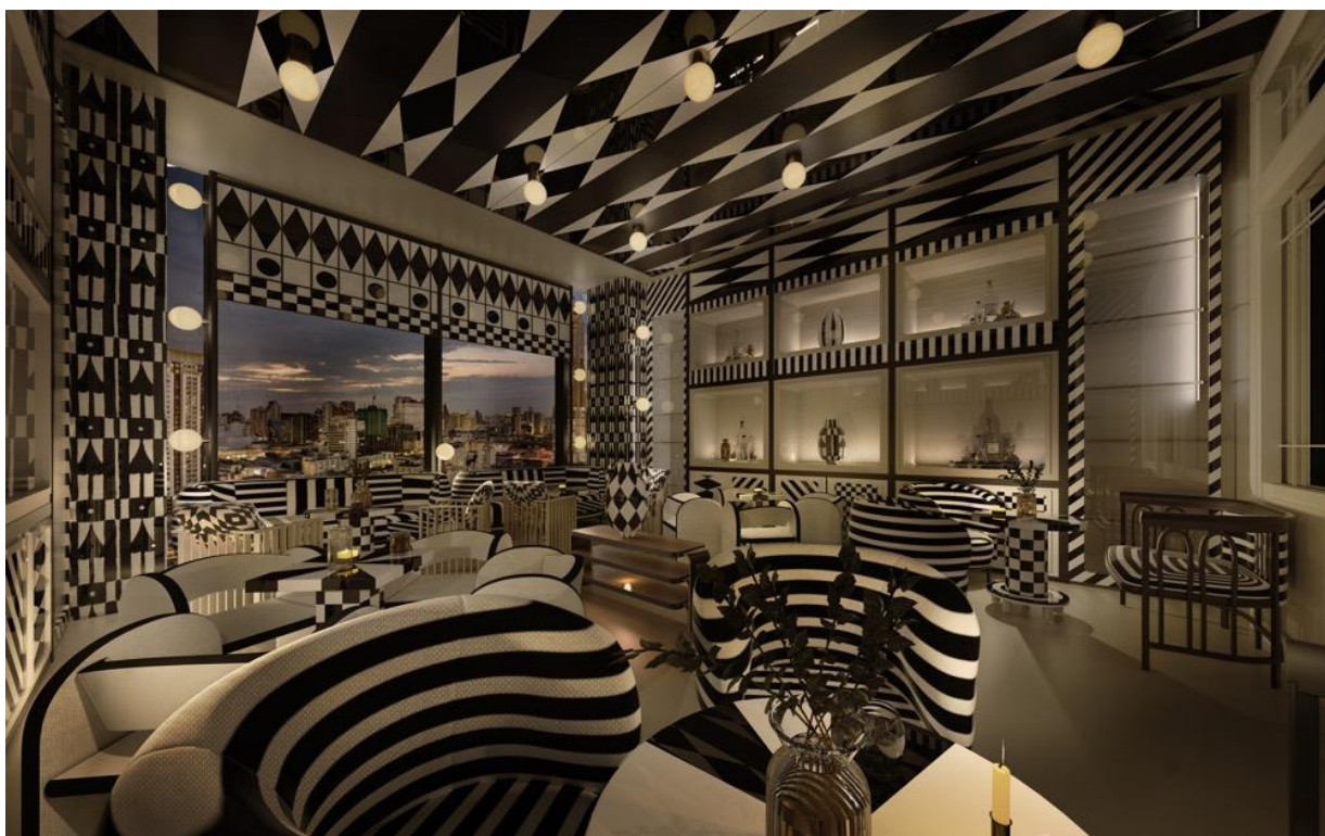
Tearoom Tease seats 24 guests.