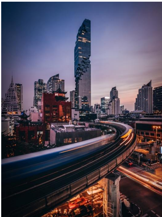
King Power MahaNakhon.