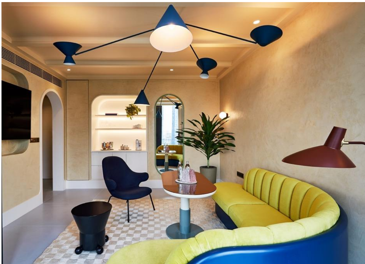
The living room of a Balcony Suite, which measures between 64 and 85 sqm.