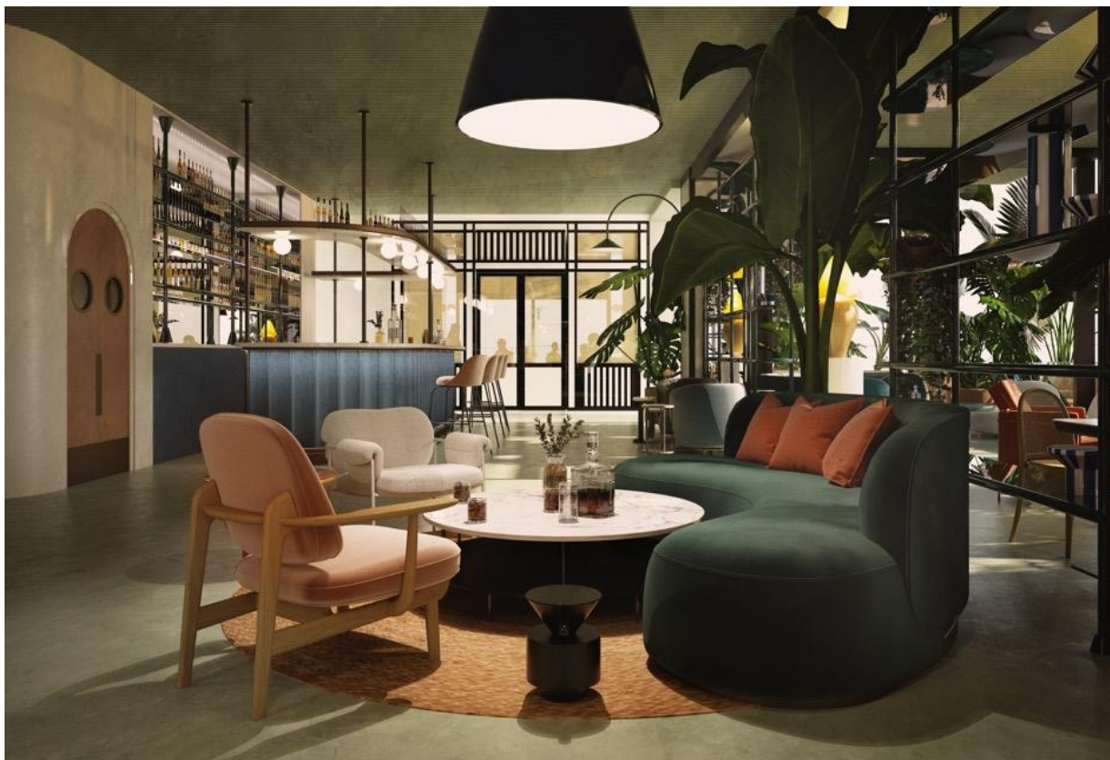
Cocktail lounge The Parlor.