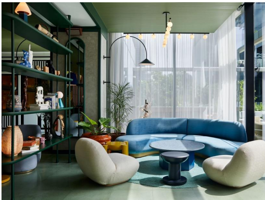
The lobby area