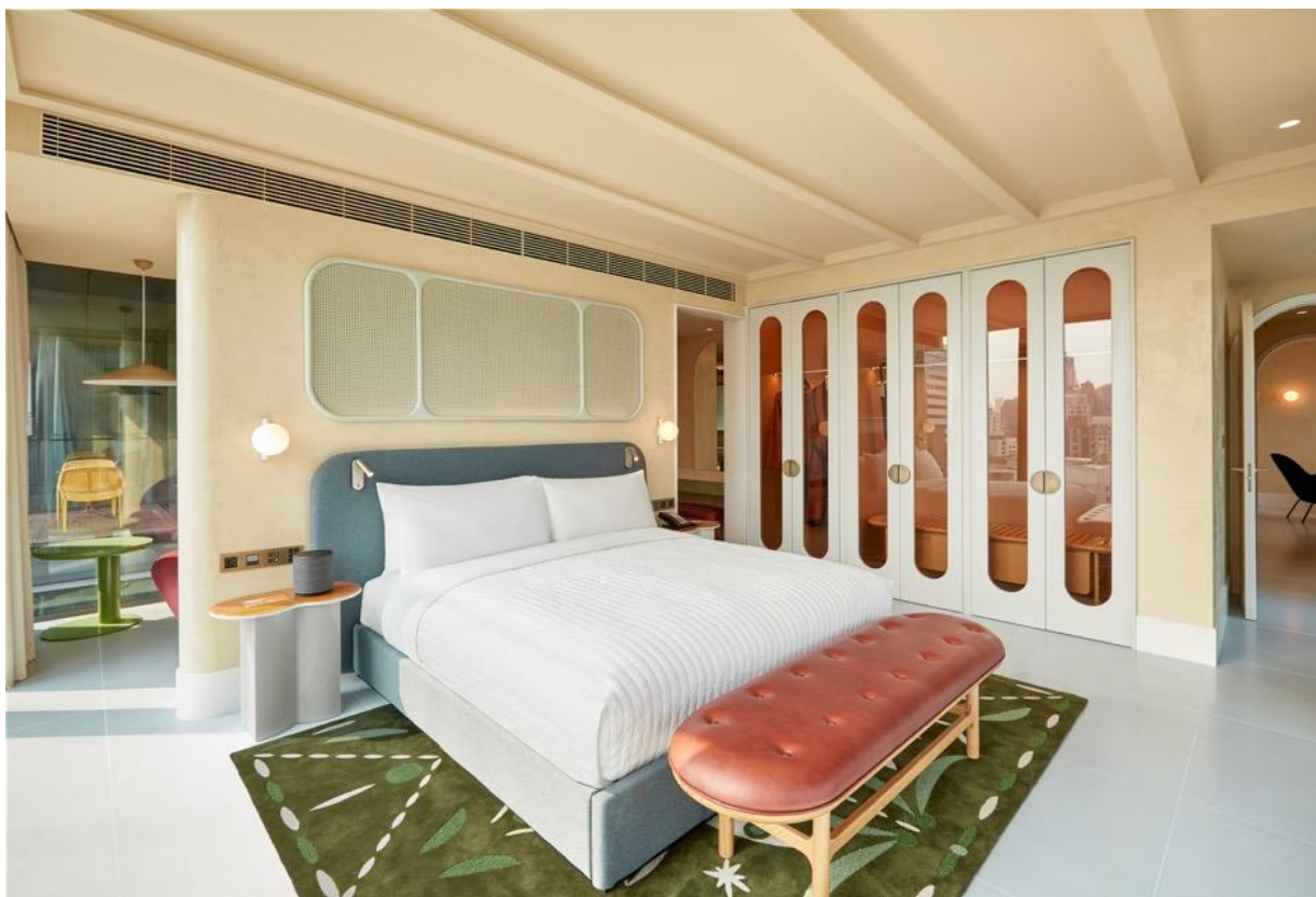
The Balcony Suites feature two big interior spaces, plus a private 4.7 sqm balcony.