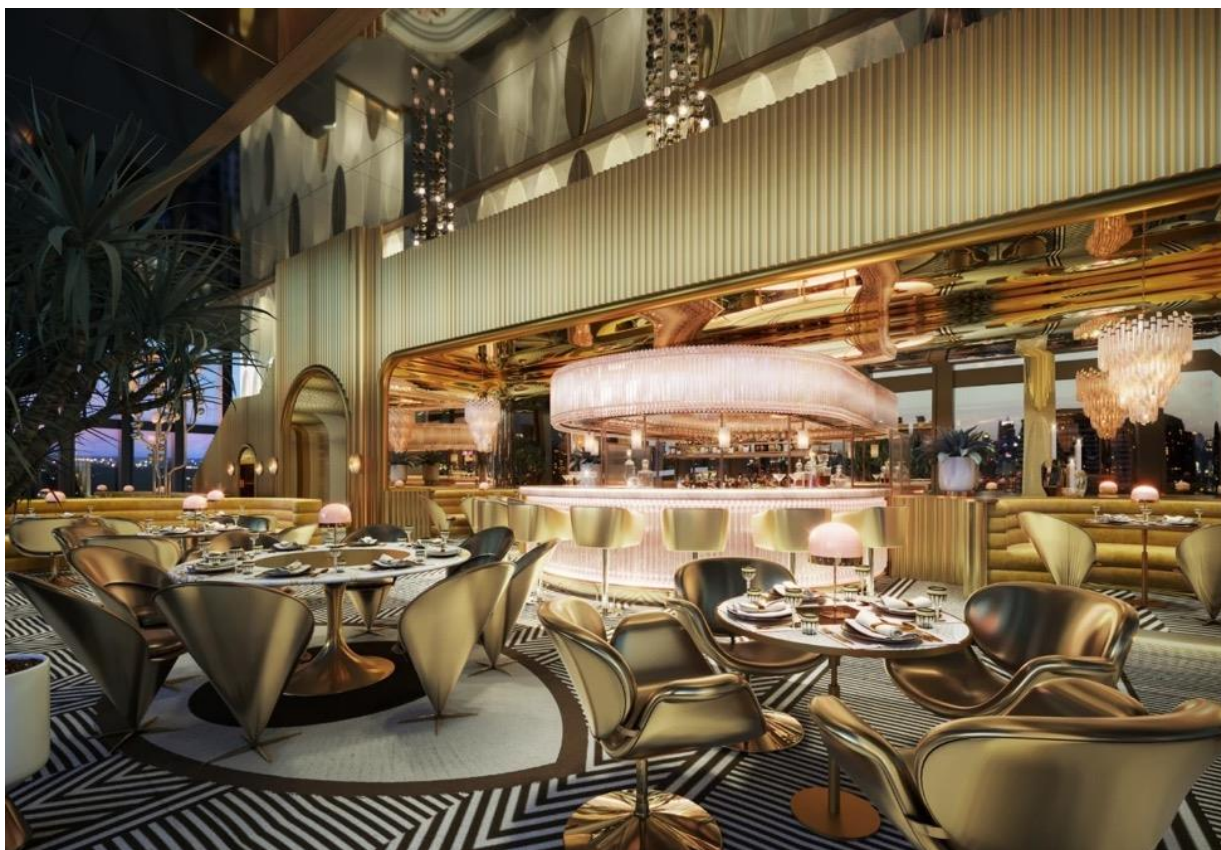
Mexican restaurant Ojo.