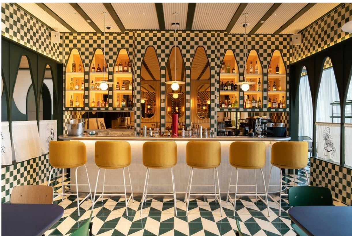
The Standard Grill.